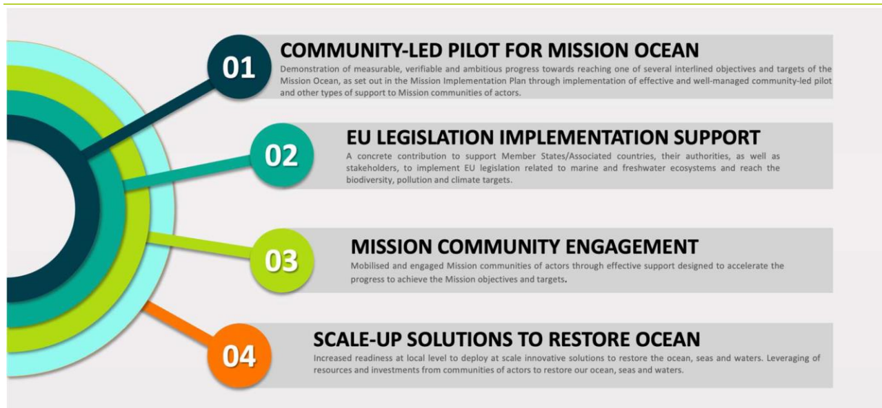
Figure 2 Expected contributions from the Open Call Applicants