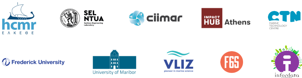
Figure 1 TASC-RestoreMed Consortium partners